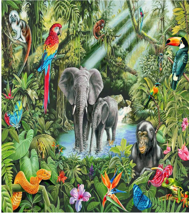
RAINFOREST ANIMALS BY DOODLEBAT72