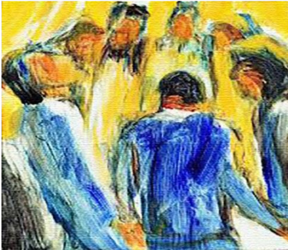
Artist Unknown; Entitled, "Gentiles Too"