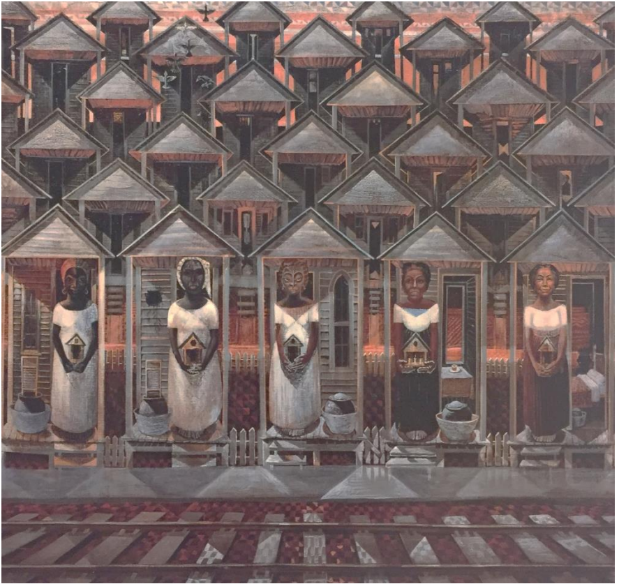
Shotguns by John Biggers