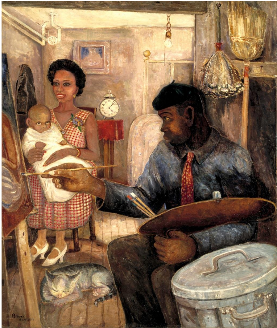
Credit: "The Janitor Who Paints," by Palmer Hayden, ca. 1930. Smithsonian American Art Museum, Gift of the Harmon Foundation