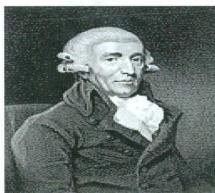
FRANZ JOSEPH HAYDN